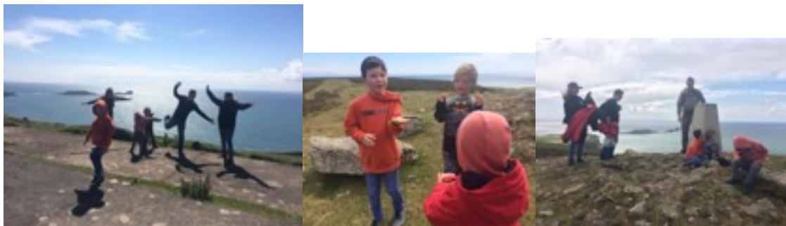
JULY Environmental beach art. Some great geometric designs created on Rhossili beach using rakes and string.