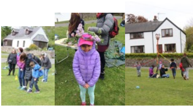
JUNE 2019 Pre father's day walk up Rhossili Downs A lovely walk up Rhossili Downs so good we did it twice!