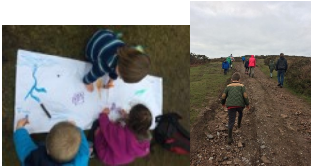
MARCH 2018 Mindfulness in the woods.

The children then learnt how to predict the weather looking at the different cloud types and how they change as fronts come across the sky. Homemade compasses were then made to test our prediction of direction and we learnt how to pace and to follow instructions up to the Gower Society stone. It was very windy on top where we looked at the amazing view to draw a map of the area before looking for more natural navigation clues in the rocks and the heather. A busy afternoon with lots of learning and enjoying our amazing environment.